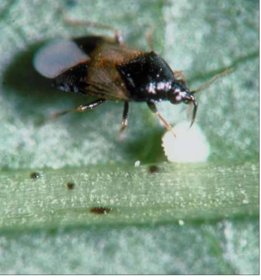
Aptly named, the minute pirate bug ( Orius insidiosus) is a tiny but voracious predator. Pirate bugs can consume around 30 small insects or eggs per day, and excel at seeking out prey at low densities