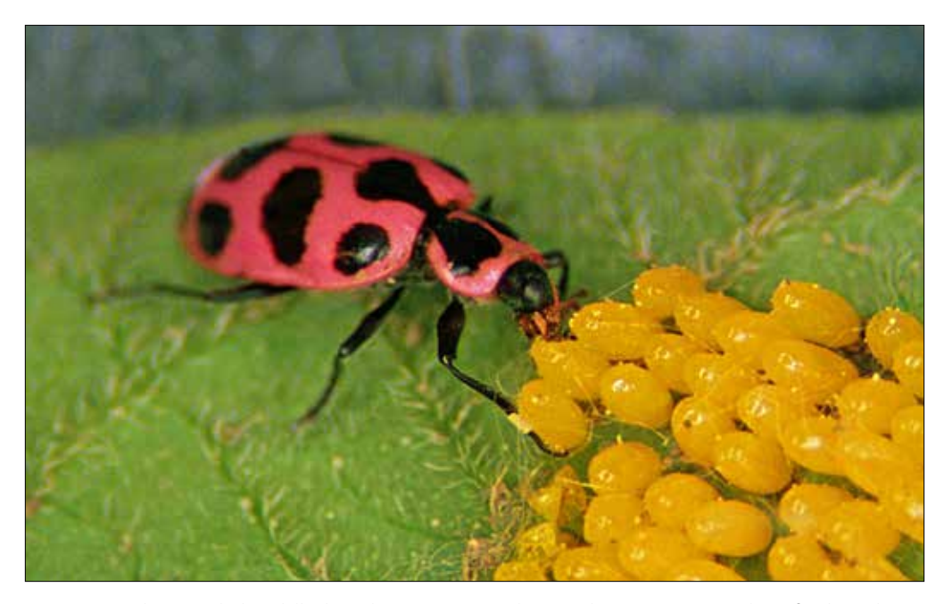
Neonicotinoids, intended to kill plant-damaging pests, have indirect impacts on beneficial predatory insects. Spotted lady beetle ( Coleomegilla maculata ) eating eggs of Colorado potato beetle.