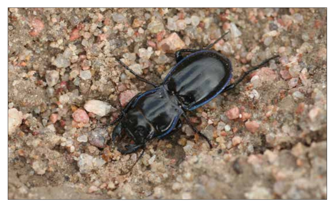
Ground beetles such as this blue-margined ground beetle ( Pasimachus elongatus ) are predators as both adults (shown) and larvae. They may be exposed to neonicotinoids directly when applied as a soil drench and indirectly via contaminated food items.

larvae of predatory ground beetles and rove beetles (Kunkel et al. 1999).