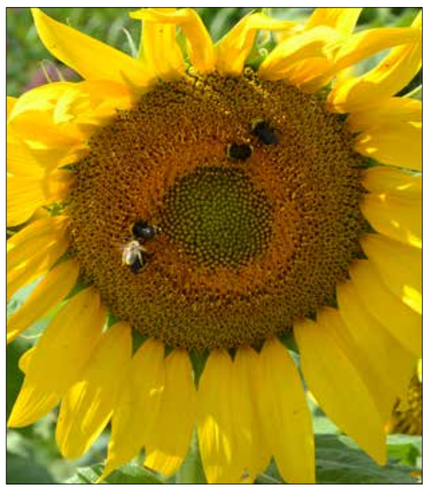
The threat from neonicotinoid residues to bumble bees and other flower-visiting insects is well known. The risk to beneficial predators and parasitoids of plant pests has generally been overlooked.

As use of neonicotinoids becomes increasingly widespread, it becomes more and more vital to understand their impacts on nontarget wildlife and consequently, ecosystem health. Much concern has been focused on the effects of neonicotinoids on bees. Bees and other pollinators are exposed to neonicotinoids in several ways, including insecticide-contaminated dust and residues in pollen and nectar. Although the balance of evidence from published research suggests that exposure through pollen and nectar rarely causes direct mortality, there is